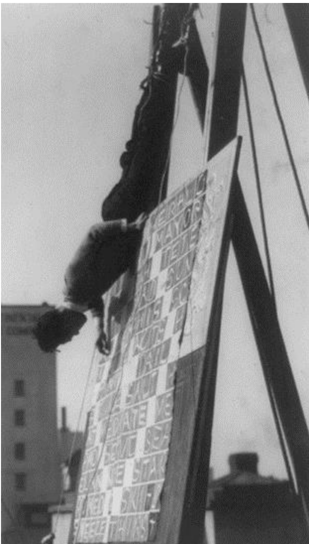
In the 1920s, youth were enamored by various fads such as pole-sitting, dance marathons, a game called mah-jongg, beauty contests, and crossword puzzles. Here, a daredevil completes a crossword puzzle while being hung from a building.

The Youth Perspective: The Old Ways Are Repressive During the 1920s, a growing drive for