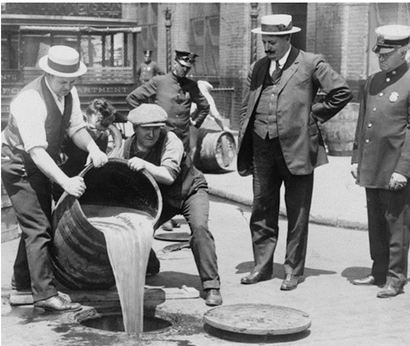
Federal agents were fighting a losing battle as they tried to destroy stashes of illegal alcohol. The harder they tried to enforce prohibition, the more fashionable it became to flout the law. "When I sell liquor, it's called bootlegging," observed Chicago gangster Al Capone. "When my patrons serve it on Lake Shore Drive, it's called hospitality."

Some states tried to legislate more conservative behavior. They passed laws to discourage women from wearing short skirts and skimpy swimsuits. Police with yardsticks patrolled beaches looking for offenders.