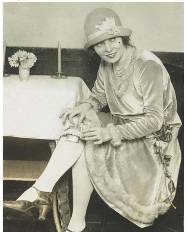
Many Americans—such as the woman shown above—chose to ignore the ban on drinking. Bootlegging became a common trade. In 1929, Assistant U.S. Attorney General Walker Wildebrandt reported that alcohol could be bought "at almost any hour of the day or night."

Many modernists attacked prohibition as an attempt by the federal government to legislate morality. Journalist H. L. Mencken, a champion of modernism, called drys "ignorant bumpkins of the cow states who resented the fact that they had to swill raw corn liquor while city slickers got good wine and whiskey." Another modernist,