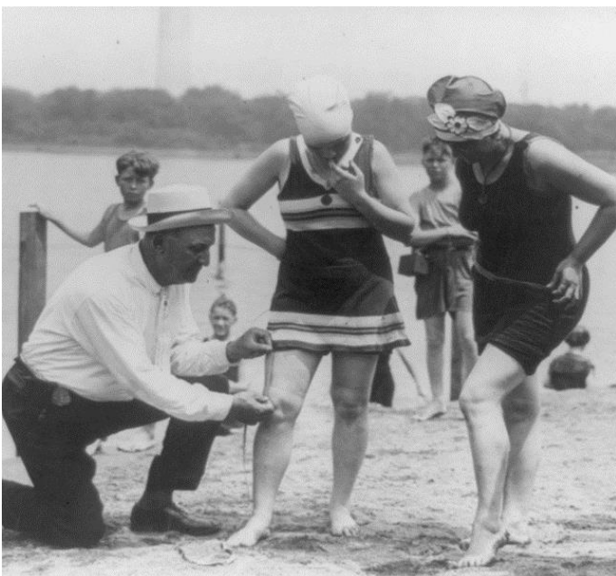
In this 1922 photograph, a Washington, D.C., policeman checks to see that a bathing suit hits no higher than six inches above the knee. Traditionalists in many communities passed laws designed to prevent women from appearing in public in immodest clothes. Nonetheless, modernists continued to wear revealing swimsuits.

—Zelda Fitzgerald, "Eulogy on the Flapper," 1922