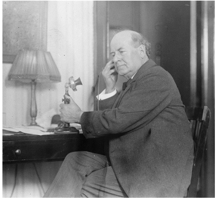
The Scopes trial pitted the respected fundamentalist William Jennings Bryan, pictured above, against the brilliant defense attorney Clarence Darrow. Although Bryan won the case, he did not win his war against the teaching of evolution. Five days after the trial, Bryan died in his sleep.

Bryan had two reasons for taking up the creationist cause. The first was his deeply held Christian faith. The second was his fear that teaching evolution could lead young people to accept social Darwinism. This is the belief that as in nature, only the fittest members of a society will survive. Social Darwinism had been used to justify imperialism on the grounds that the fittest, or most powerful, peoples should rule the less powerful. It had also been used to promote eugenics , or the idea that the human species should be improved by forbidding people with characteristics judged undesirable to reproduce. Bryan saw such views as a threat to the poor and weak. He worried that widespread acceptance of social Darwinism and eugenics "would weaken the cause of democracy and strengthen class pride and power of wealth."