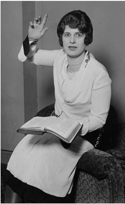
Aimee Semple McPherson, a famous fundamentalist preacher, founded the International Church of the Foursquare Gospel. In 1923, she built the Angelus Temple, which sat more than 5,000, in Los Angeles, California. She enhanced her services there with bands, choirs, and other theatrical touches. Radio broadcasts increased her audience and made her a nationally known religious figure.